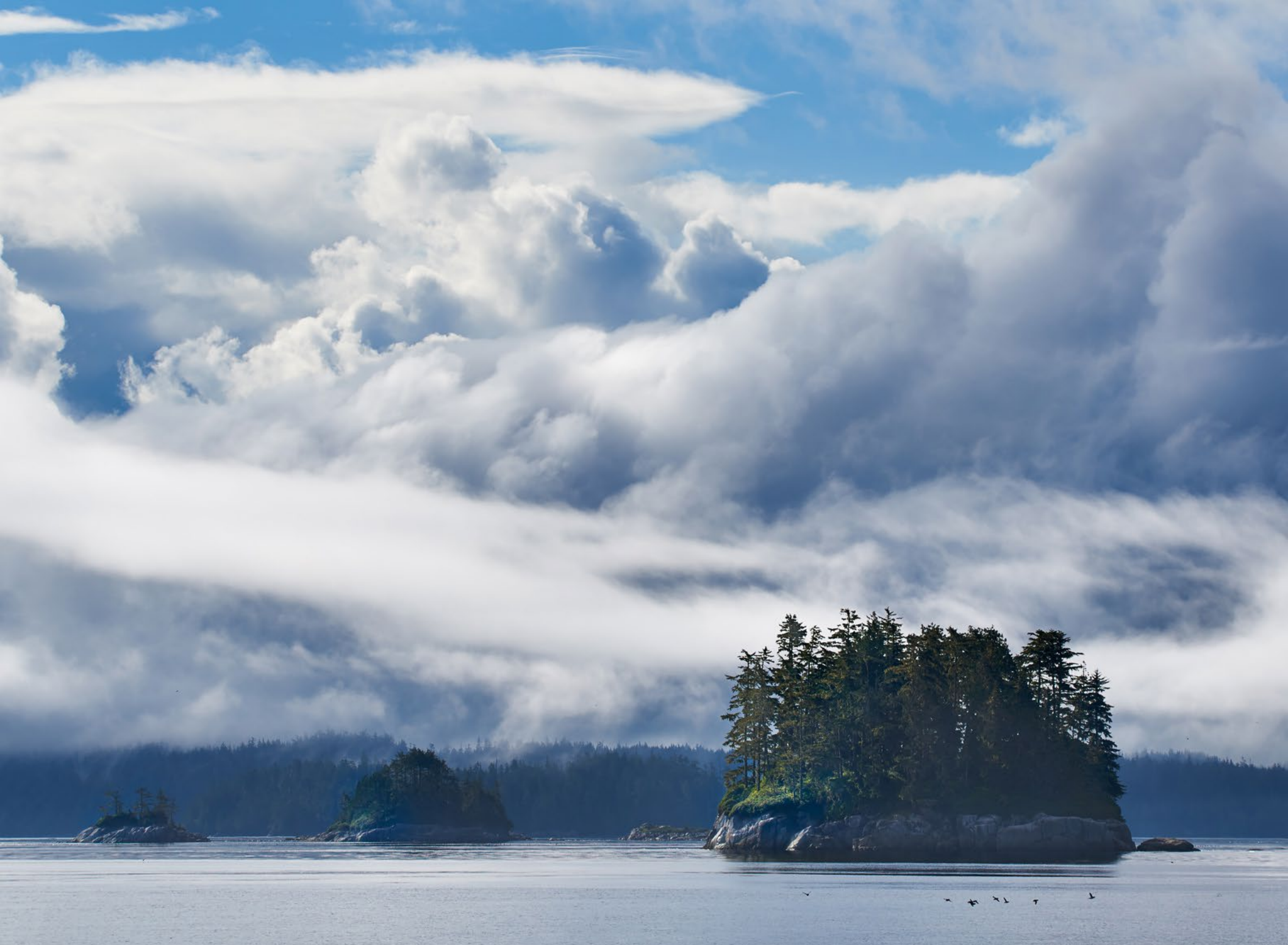
Landscape Photography Nirvana! The many islands and islets – and dramatic skies – often lead to great land- and seascape photographic opportunities on this trip! Nikon D5 with Sigma 150-600mm zoom @ 150mm. 1/800s @ f8. ISO 160.