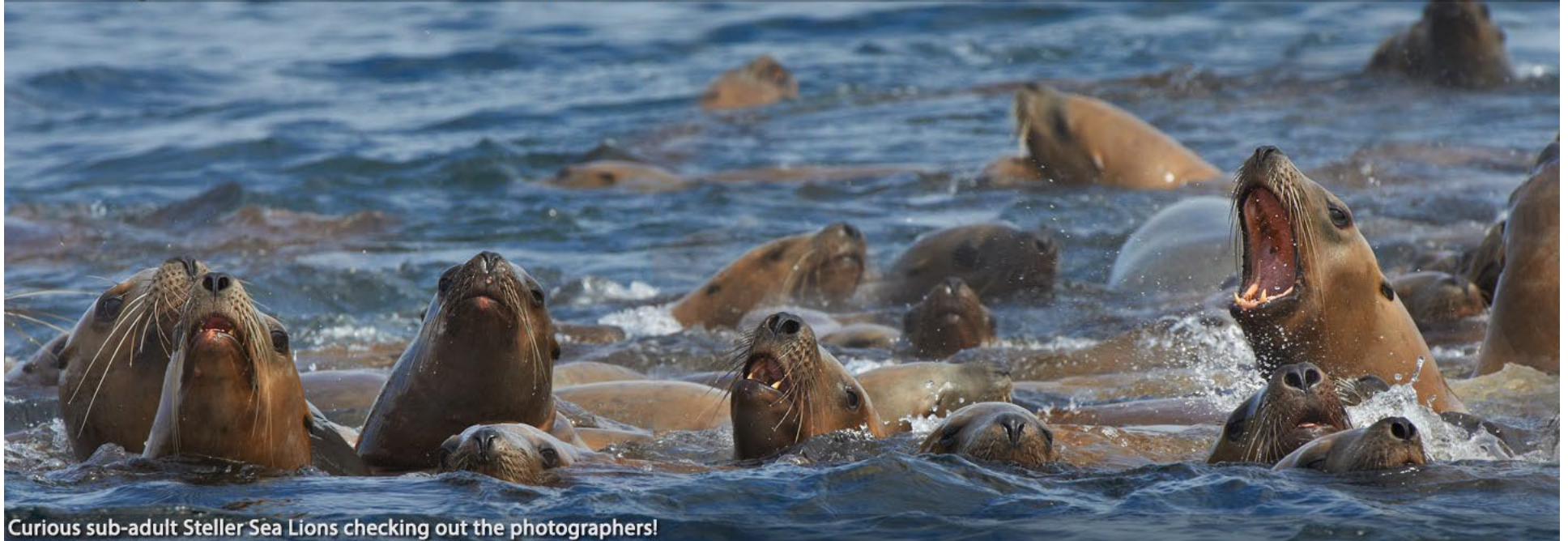
Curious sub-adult Steller Sea Lions checking out the photographers!