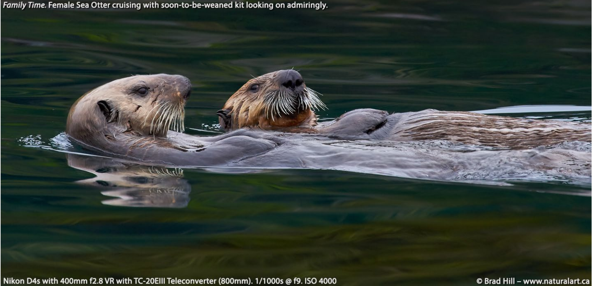
Family Time. Female Sea Otter cruising with soon-to-be-weaned kit looking on admiringly.

Nikon D4s with 400mm f2.8 VR with TC-20EIII Teleconverter (800mm). 1/1000s @ f9. ISO 4000