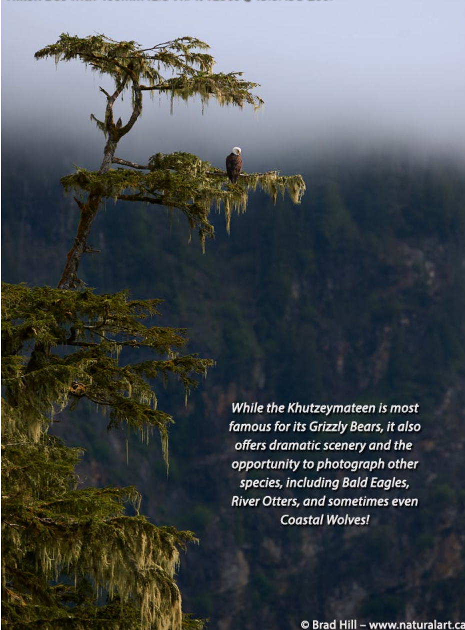
The Sentinel - Khutzeymateen Inlet Nikon D3s with 400mm f2.8 VR. 1/1250s @ f5.6. ISO 200.

While the Khutzeymateen is most famous for its Grizzly Bears, it also offers dramatic scenery and the opportunity to photograph other species, including Bald Eagles, River Otters, and sometimes even Coastal Wolves!