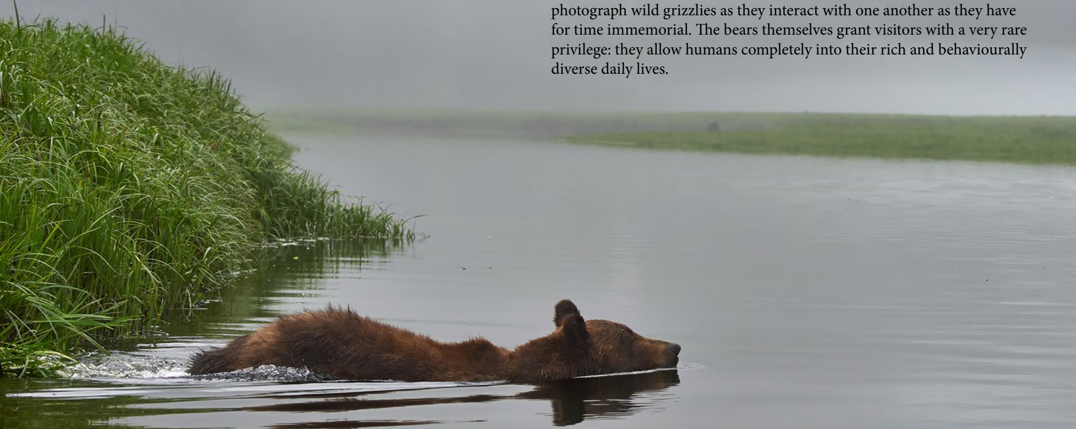
The Khutzeymateen Estuary. Accessible only at high tide, the Khutzeymateen estuary is a grass and wildflower covered grizzly garden (complete with water features!). We'll split our time in the field between the estuary and several of the alluvial fans found in the main Khutzeymateen Inlet.

The Khutzeymateen Grizzly Sanctuary. The 39,000 hectare (96,000 acre) Khutzeymateen Grizzly Sanctuary is Canada's only Grizzly Bear sanctuary and is located at the tip of a long and remote inlet on the northern coast of British Columbia. There are no roads, settlements, or even campsites in the region - it is true pristine wilderness. The bulk of the sanctuary is closed to the public – only two professional guides have licenses to lead very small groups into the heart of this majestic and globally unique ecosystem. The inlet is home to about 50 resident grizzlies, with many more passing through during the year. This remote piece of wilderness is set within one of the planet's few remaining completely intact temperate rainforests and offers a stunning, verdant backdrop to observe and photograph wild grizzlies as they interact with one another as they have for time immemorial. The bears themselves grant visitors with a very rare privilege: they allow humans completely into their rich and behaviourally diverse daily lives.