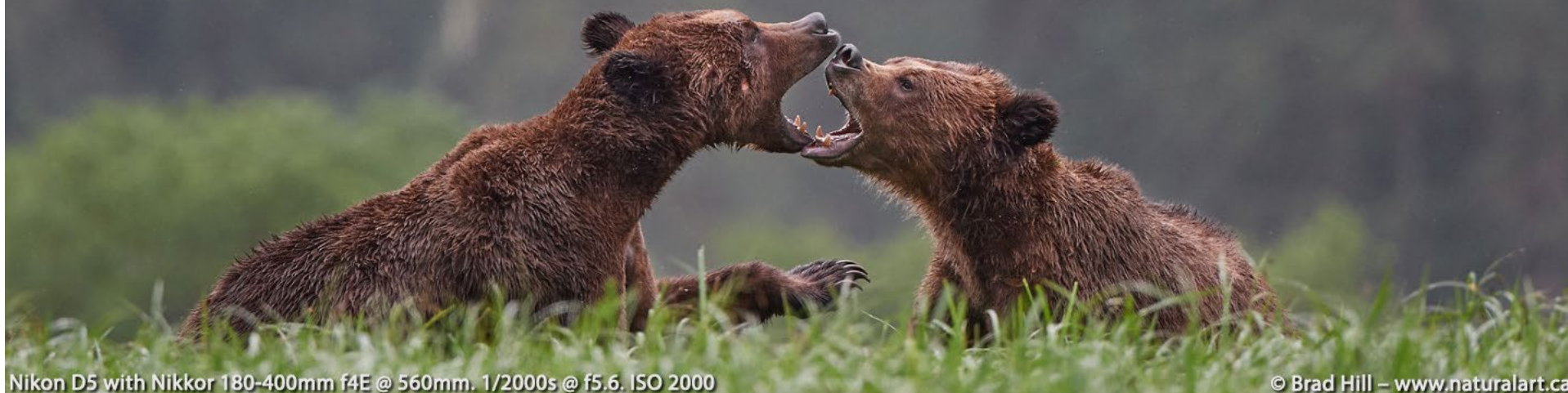
Rough-housing in the Khutz!

only two professional guides are allowed to lead very small groups into the heart of this majestic, globally unique ecosystem. The inlet is home to about 50 resident grizzlies, with many more passing through during the year. This remote piece of wilderness is set within one of the planet's few remaining completely intact temperate rainforests and offers a stunning, verdant backdrop to observe and photograph wild grizzlies as they interact with one another as they have for time immemorial. The bears themselves grant visitors with a very rare privilege: they allow humans completely into their rich and behaviourally diverse daily lives.