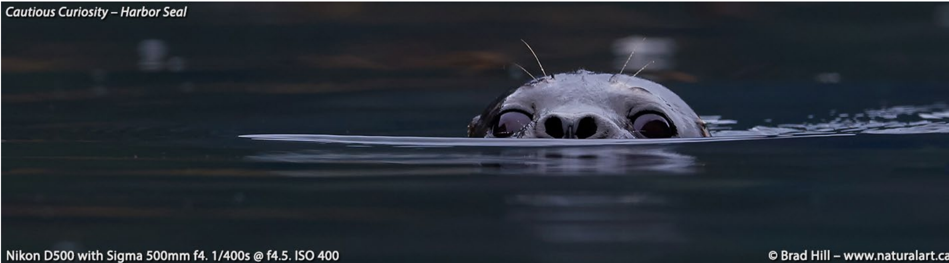
Cautious Curiosity – Harbor Seal

Nikon D500 with Sigma 500mm f4. 1/400s @ f4.5. ISO 400