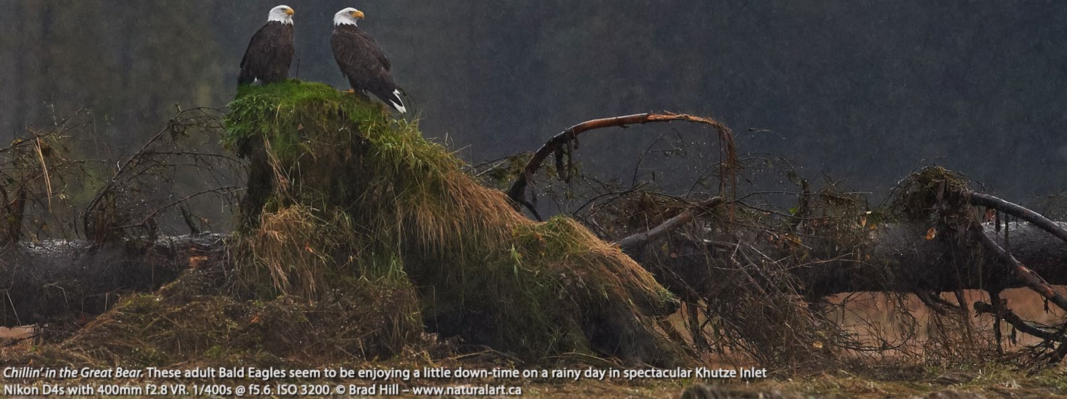
Chillin' in the Great Bear. These adult Bald Eagles seem to be enjoying a little down-time on a rainy day in spectacular Khutze Inlet Nikon D4s with 400mm f2.8 VR. 1/400s @ f5.6. ISO 3200.