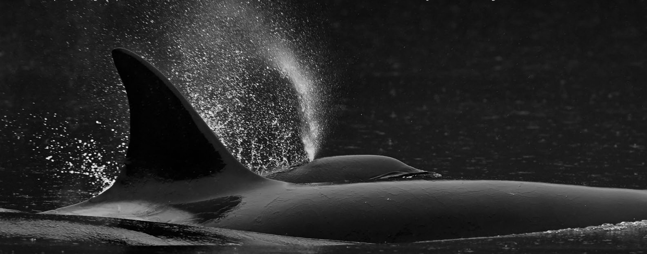
The Blow! This female Killer Whale and her calf are part of a small pod of 5 transient Killer Whales hunting for their primary prey – marine mammals. Transient Killer Whales can be seen in both the inside and outside coastal waters of the Great Bear Rainforest.

Photography instruction will also take place during our time on the Passing Cloud . This instruction will be less formal and on a “time-permitting” basis. The topics will vary, depending on both the specific interests of, and requests made by, those on the trip. It could include sessions on digital workflow topics, including raw image processing through to discussions on field-techniques and camera gear.