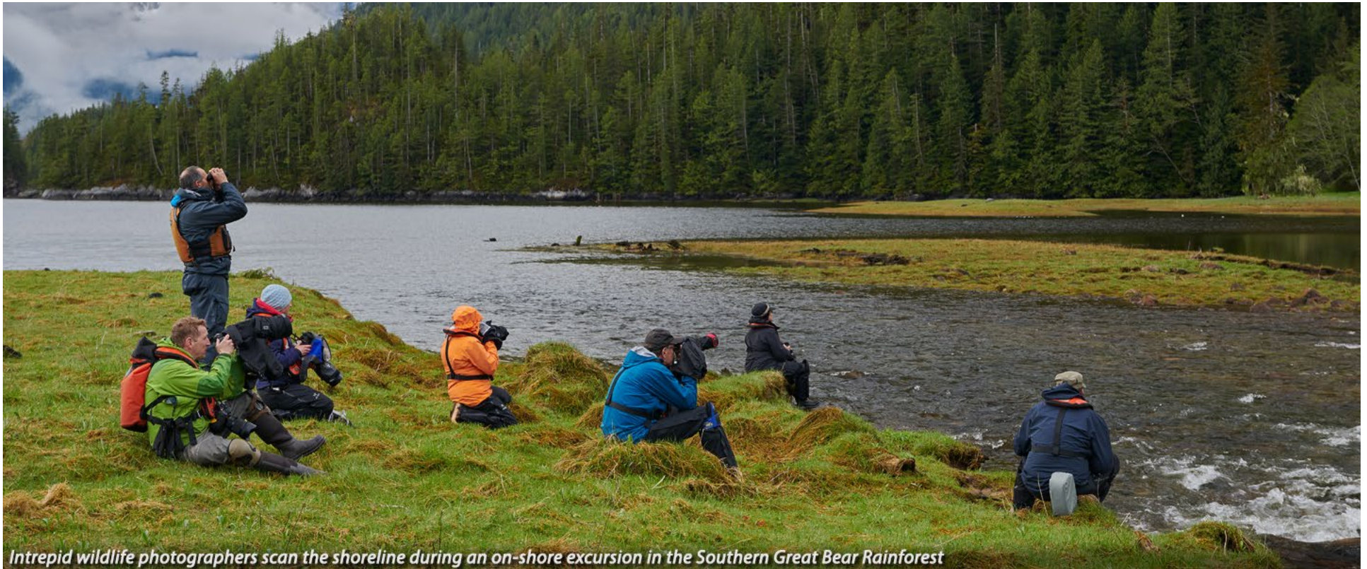
Intrepid wildlife photographers scan the shoreline during an on-shore excursion in the Southern Great Bear Rainforest

shooting, but you will be shooting while sitting or kneeling far more frequently. A degree of flexibility and/or suppleness can make your time in the Zodiac® far more productive and enjoyable!