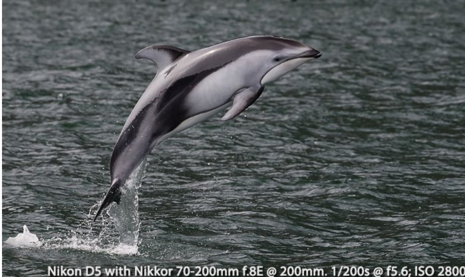
Jumping for Joy? Pacific White-sided Dolphins search the channels of the Great Bear Rainforest each spring in search of spawning Eulachon (AKA candlefish).

Nikon D5 with Nikkor 70-200mm f.8E @ 200mm. 1/200s @ f5.6; ISO 2800