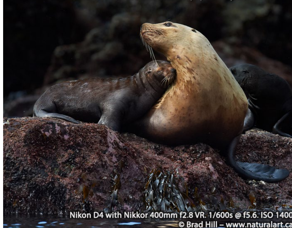
A Tender Moment. Female Steller Sea Lion with her pup of the year

Nikon D4 with Nikkor 400mm f2.8 VR. 1/600s @ f5.6; ISO 1400