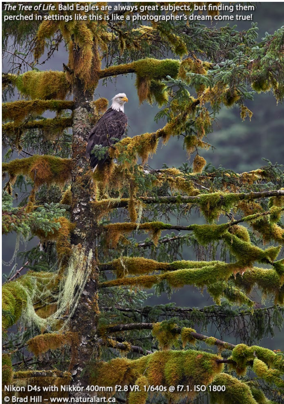
Nikon D4s with Nikkor 400mm f2.8 VR. 1/640s @ f7.1. ISO 1800

The Tree of Life. Bald Eagles are always great subjects, but finding them perched in settings like this is like a photographer's dream come true!