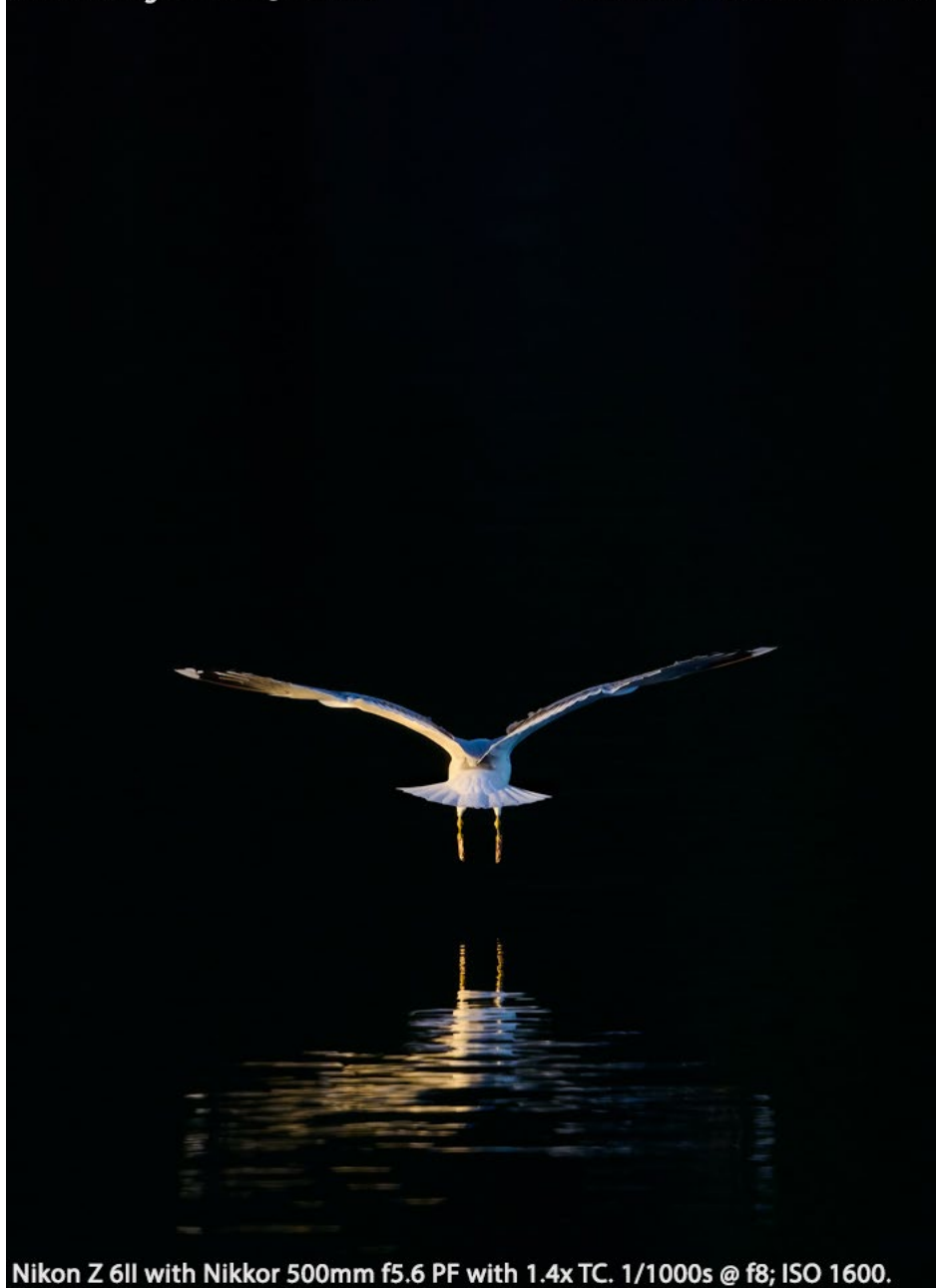
Nikon Z 6II with Nikkor 500mm f5.6 PF with 1.4x TC. 1/1000s @ f8; ISO 1600.

And, a FINAL-FINAL piece of advice: I highly recommend that you try out EACH piece of gear you will be bringing with you before you come to the BC coast. This includes everything from your clothing through to your cameras and lenses and even packs and/or belt-and-holster systems (it's never good to discover that your rain cover needs a specific eyepiece once you're in the wilderness!).