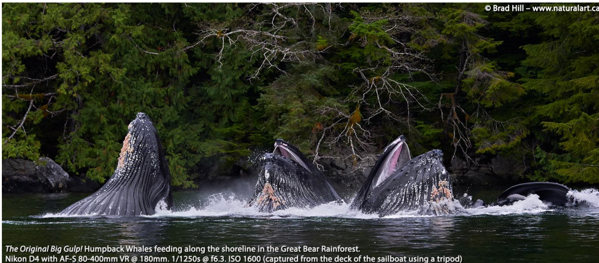
The Original Big Gulp! Humpback Whales feeding along the shoreline in the Great Bear Rainforest. Nikon D4 with AF-S 80-400mm VR @ 180mm. 1/1250s @ f6.3. ISO 1600 (captured from the deck of the sailboat using a tripod)

This system allows me to take only a very small (or no) pack into the Zodiac®. And, most importantly, it ensures my gear is quickly and easily accessible , which has allowed me to capture many good images that I may have otherwise missed. I experimented with this system because I had noticed that within the confines of the Zodiac® it was often difficult or slow to access gear sitting in a larger backpack (and I was reluctant to open the pack if it was raining out). At this point I can say I am very happy with how the belt system works for me.