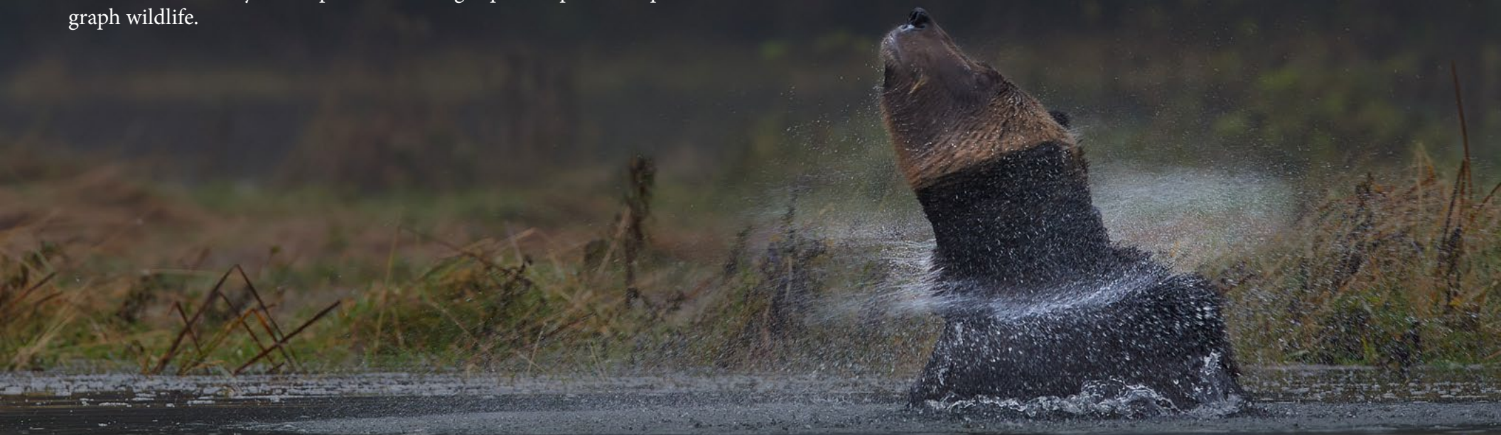
Shake it Up! Adult male Grizzly pausing in his pursuit of prey for a quick shake.

Nikon D4 with 400mm f2.8 VR. 1/400s @ f6.3. ISO 560.