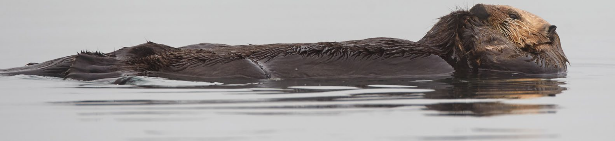
Sea Otter in iconic pose. This image was captured while in a Zodiac® during our Marine Mammals photo tour in August of 2014. Nikon D4 with Nikkor 80-400mm f4.5-5.6. 1/800s @ f7.1; ISO 320.