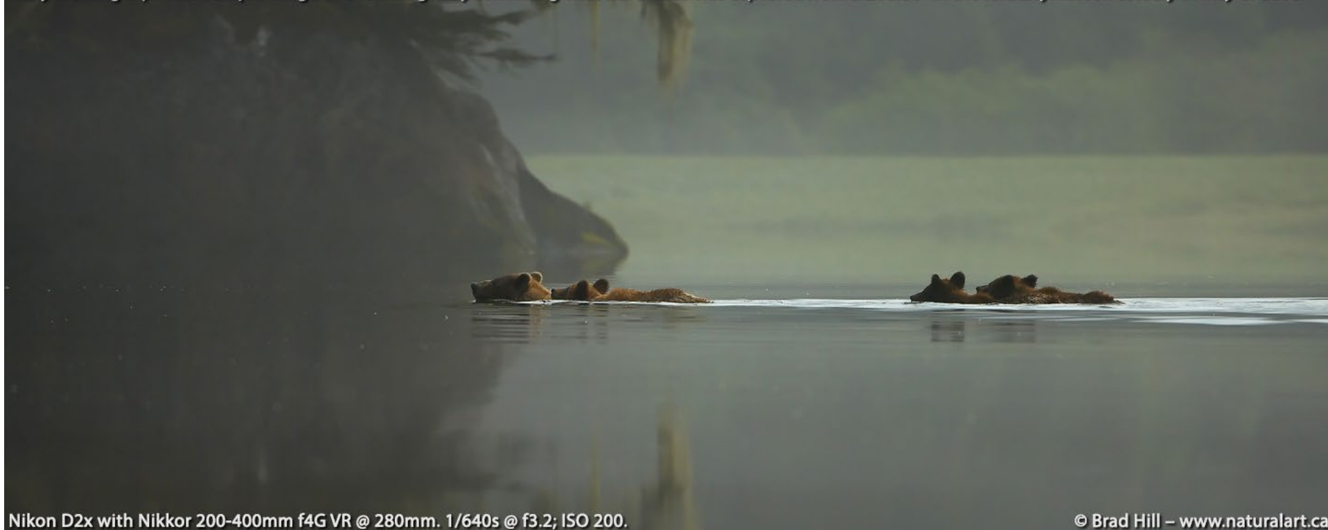
Misty Morning Dip. This tranquil image of a female grizzly swimming with her 3 cubs was captured from a Zodiac® in the Khutzeymateen estuary in May of 2006.

Nikon D2x with Nikkor 200-400mm f4G VR @ 280mm. 1/640s @ f3.2; ISO 200.