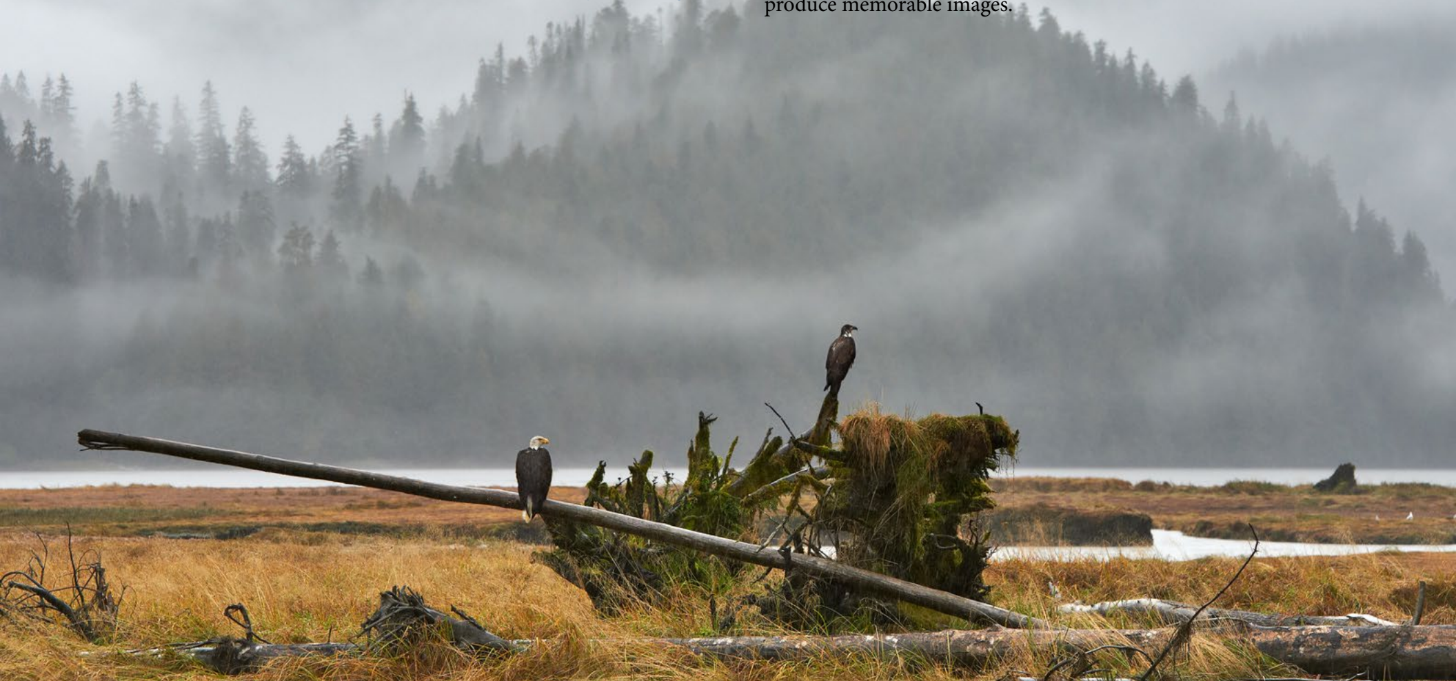
Eagles in the Mist. There is no better place to capture images of eagles and other wildlife with stunning backdrops than on the coast of British Columbia. Nikon D4 with 70-200mm f4 VR @ 150mm. 1/160s @ f8. ISO 720.

4. Shooting Style – Machine Gunning vs. Selective Shooting. With the advent of very fast digital cameras and relatively low-priced high-capacity memory cards it has become very tempting to simply keep your index finger pushing the shutter release and "capture everything." The philosophy and/or motivation behind this approach tends to be either "...well, at least some of those shots should be sharp" or "...I must have captured something interesting in that batch." My experience is that this approach produces, at best, a few relatively sharp shots of something that's usually not too visually interesting. There ARE times where "letting it rip" is a good strategy (often with action shots, such as when bears are sparring), but more often than not I feel that a more selective shooting style and waiting for the "decisive moment" is more likely to produce memorable images.